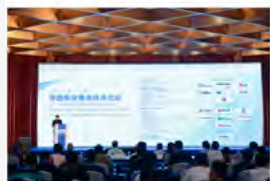
中国航空推进技术论坛现场